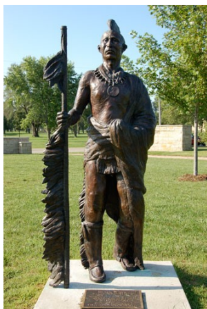
Black Hawk, Chief, 19th C. Mississippi River Sculpture Park

The work Community Development Alternatives accomplished in 2019 informs our work looking forward. Each year we learn something new and apply it to our vision of what lies ahead. This can certainly be said of the Coronavirus Pandemic, an event none of us expected, yet each of us will learn from. The pandemic presents challenges, but also opportunities to reinvent ourselves. With its experience in managing state and federal grants, CDA stands ready to help the recovery.