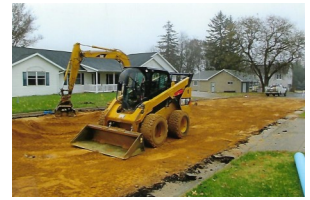
Fennimore 4th Street Project

grant helped fund the $900,000 project, which consisted of the construction of a 7,000 sq. ft. fire station on 5 acres of donated land in the Township. The project will provide 23 volunteer firemen and 11 emergency medical first responders with adequate training space and the maintenance of all equipment in a controlled environment, allowing for a quicker response time. This project became eligible through a Township-wide income survey that verified the Town was at least 51% LMI. Fire Department volunteers were instrumental in the survey process.