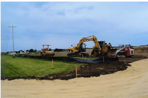
Glen Haven Fire Station Site Preparation