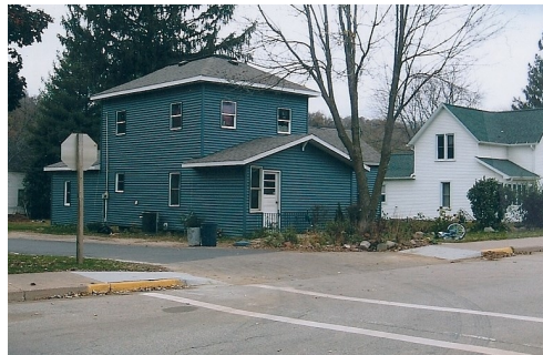
A CDA Housing Rehabilitation Project

We can do anything we want to do if we stick to it long enough. Helen Keller