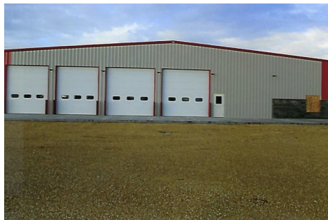
Completed Glen Haven Fire Station

The most important thing in communication is to hear what isn't being said. Peter Drucker